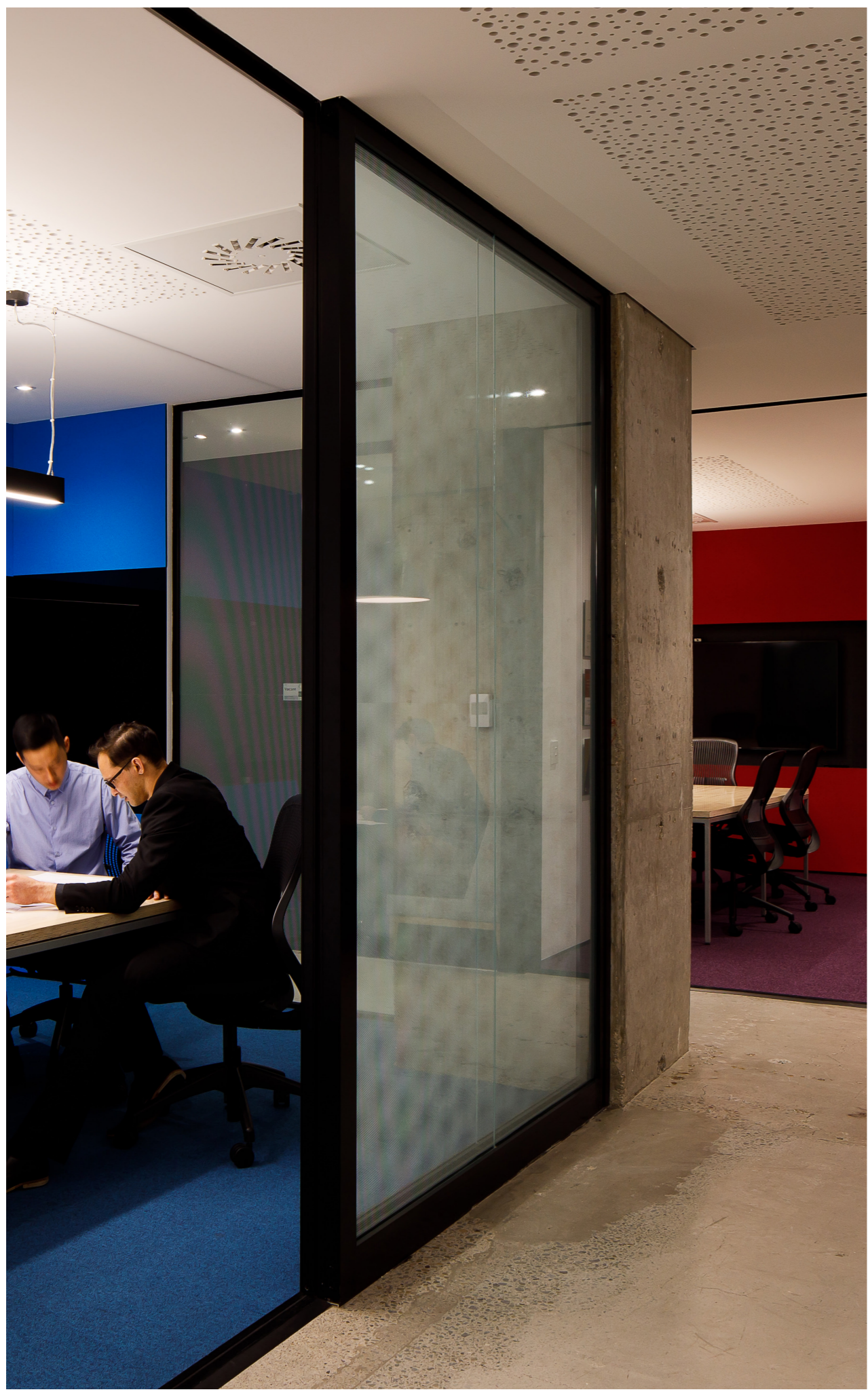
● Designgroup Stapleton Elliot, New Zealand