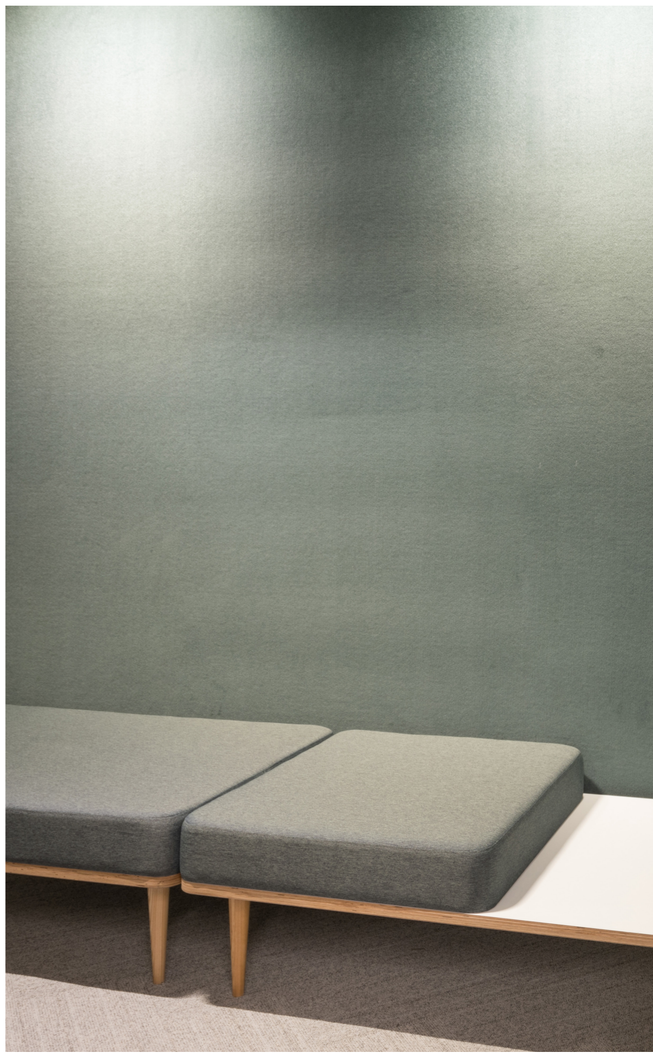
● Symphony in Sage